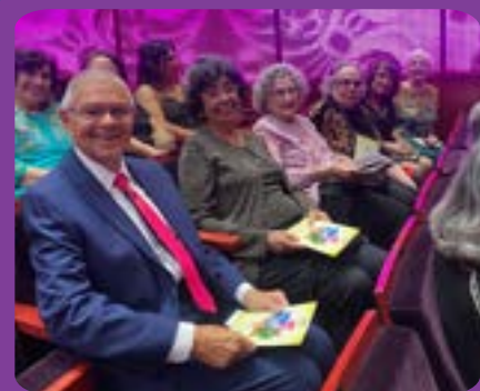
Residents attending an opera at the Tobin Center