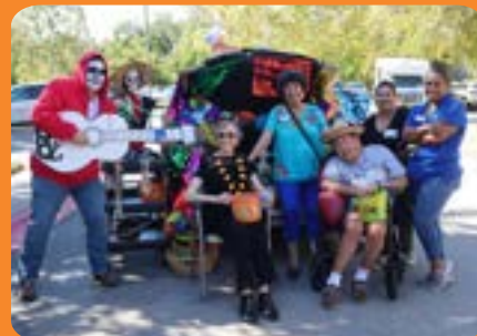
Residents pass out candy at our Halloween Trunk or Treat