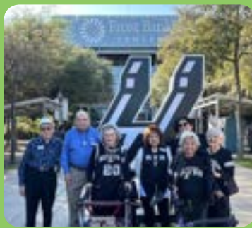
Residents enjoy cheering on the Spurs at a game!